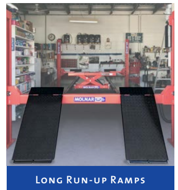
LONG RUN-UP RAMPS

Specifications/Images subject to change without prior notice. To validate warranty, proof of a valid maintenance contract will be required. Images and Illustrations are indicative and may be modified without notice