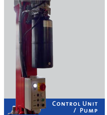
CONTROL UNIT / PUMP