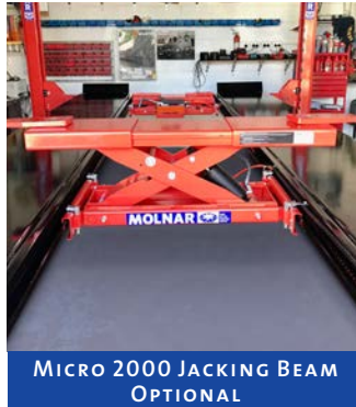
MICRO 2000 JACKING BEAM OPTIONAL