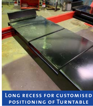
LONG RECESS FOR CUSTOMISED POSITIONING OF TURNTABLE