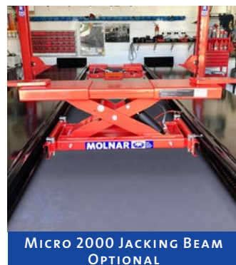
MICRO 2000 JACKING BEAM OPTIONAL