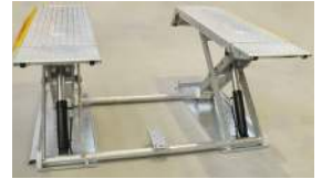
Fire galvanization of scissors and base plate for corrosive environment