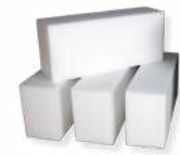
Polymer pads 100 x 150 x 340 mm