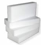
Polymer pads 50 x 150 x 340 mm (included)