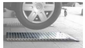
Tuning ramps for low or sports cars, set of 4 units